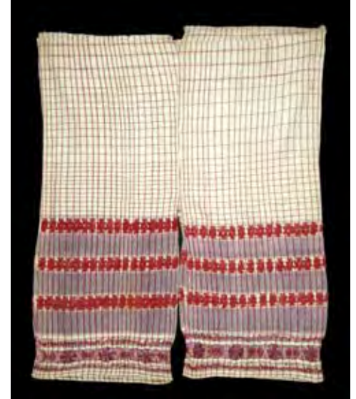
Emroidered ceremonial pants from Almolonga